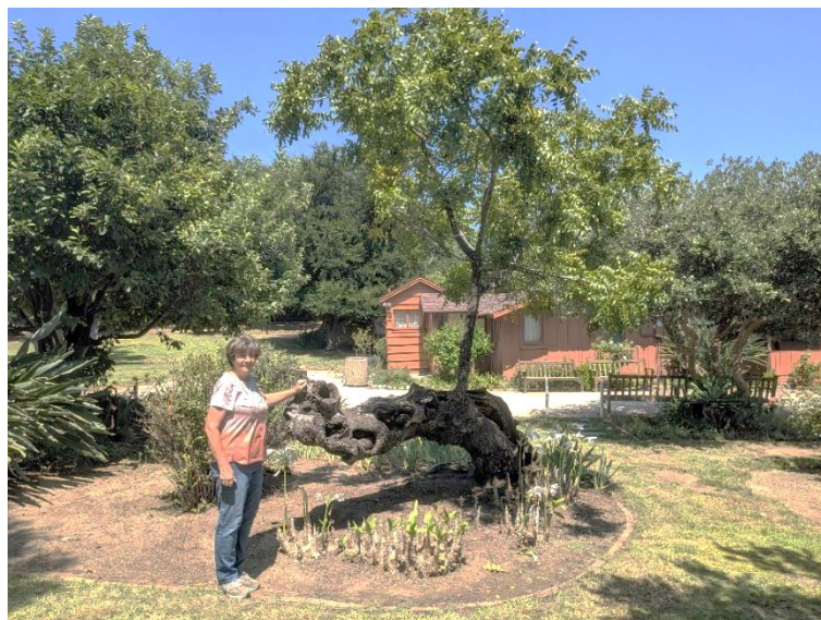
Black Walnut leaves