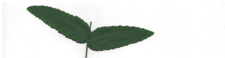
Hybrid Walnut leaves